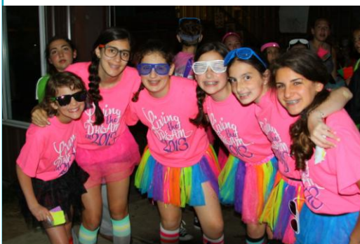
$$ CASINO NIGHT $$