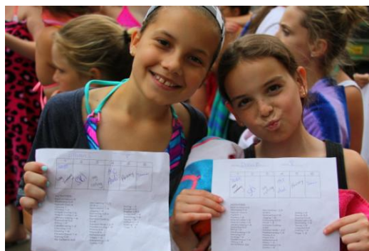
Activity sign up with friends