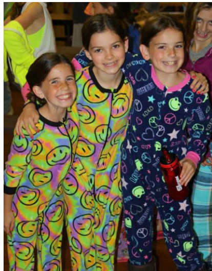
Eating breakfast in your PJs