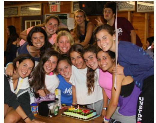
Celebrating your birthday at camp!